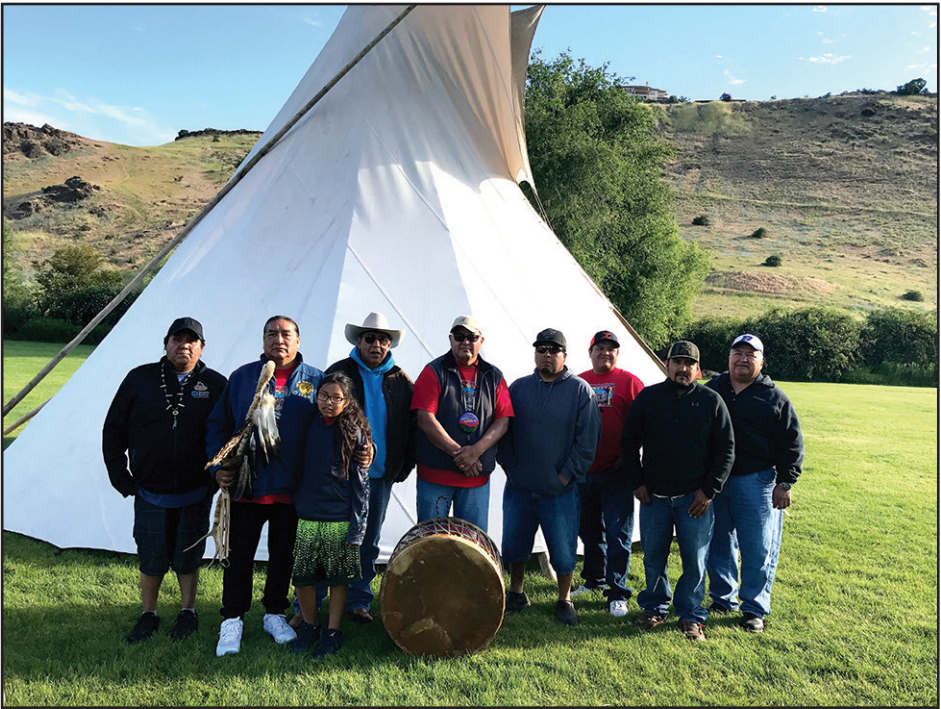
Singers gather for a group picture after Sunday's sunrise ceremony.