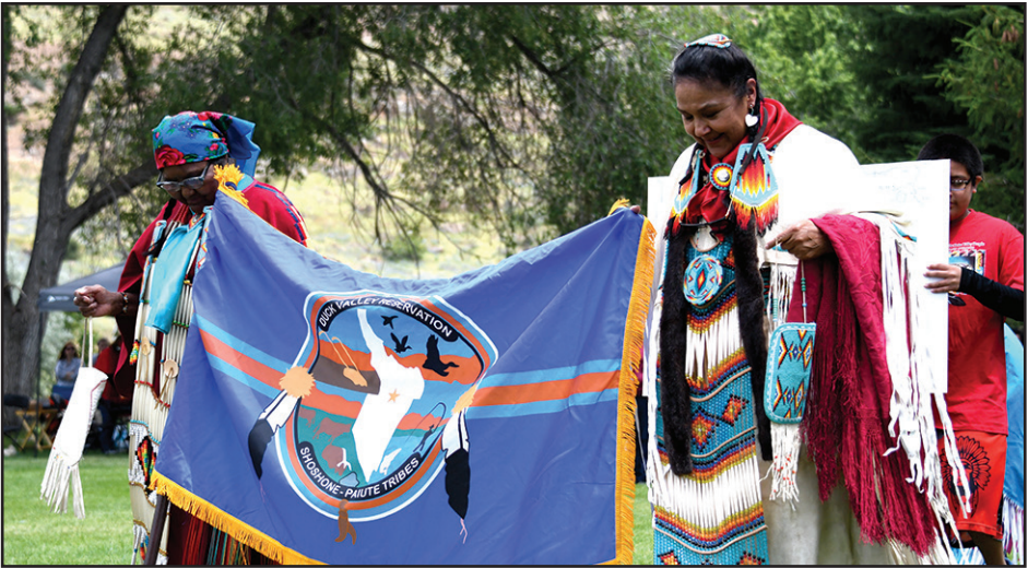
Sho-Pai participants represent their tribal flag.

standing of local history and so that healing can take place.