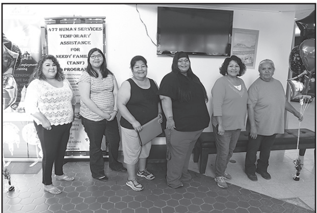
TANF Work Force Certificate training recipients.