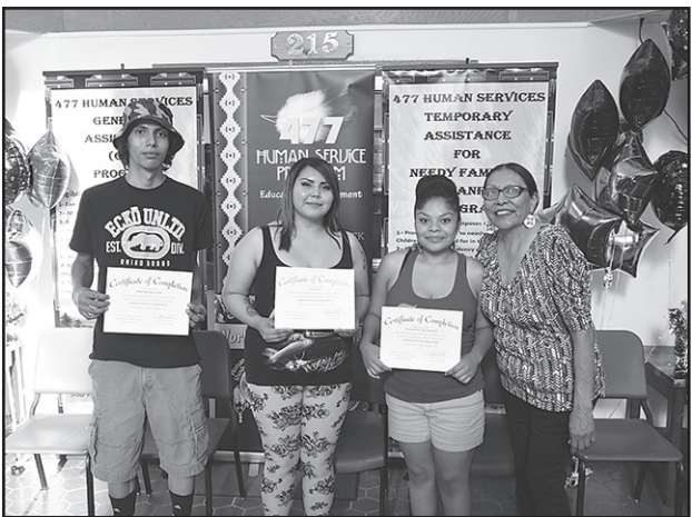
GED graduates at the ceremony.