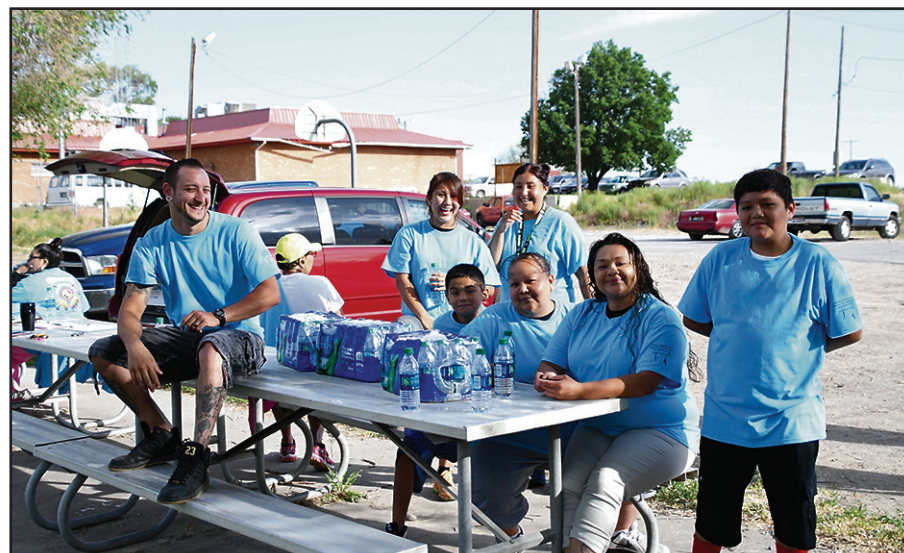
Participants and THHS staff after the Wellness Gathering Fun Run/Walk on June 7.