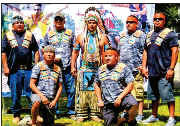
Two Tone team also received Best Dress award.