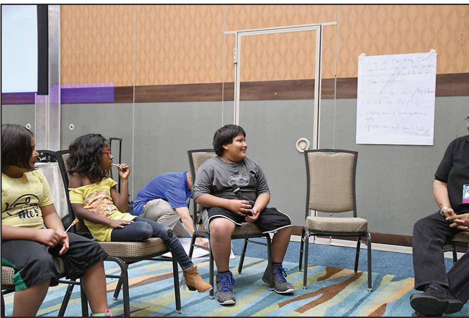
Youth participate in another activity.