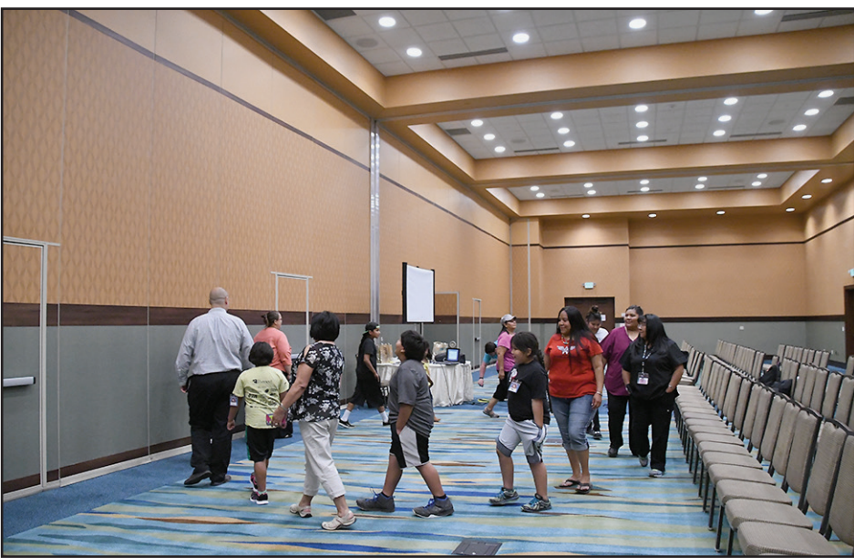
Youth do an exercise at the Wellness Gathering last week.