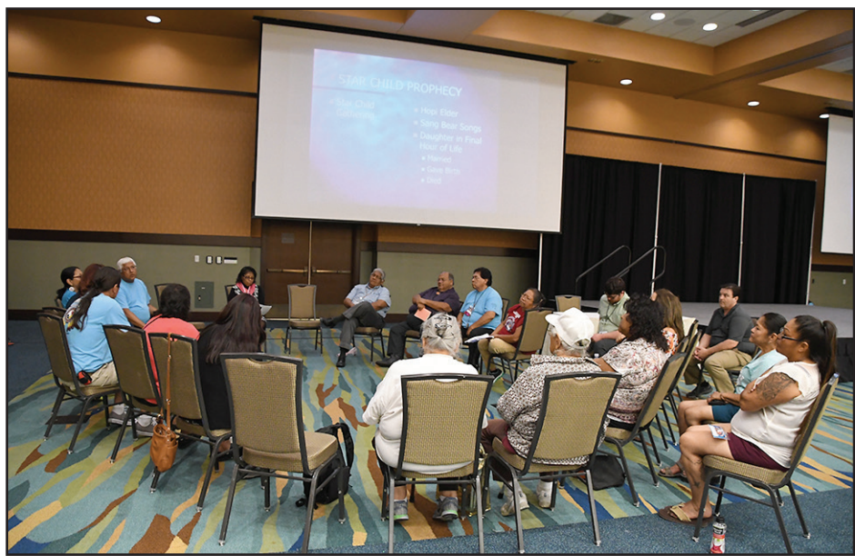
Several participated in the two-day Wellness Gathering event.